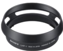
LHP-1 Lens Hood Bayonet-type, aluminum hood for lens protection