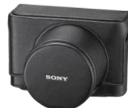
LCJ-RXB Exclusively Designed Leather Jacket Case