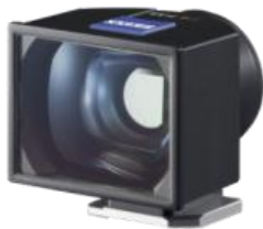
FDA-V1K Optical Viewfinder Kit Clearer view with Carl Zeiss T* coating

The Cyber-shot RX1 is accompanied with a range of dedicated optional accessories to enhance the camera experience. The Optical Viewfinder (FDA-V1K) adds functionality with Zeiss optics. Also available are an Electronic Viewfinder (FDA-EV1MK), exclusive Jacket Case (LCJ-RXB), Lens Hood (LHP-1) and a Thumb Grip (TGA-1) for sure, comfortable handling.