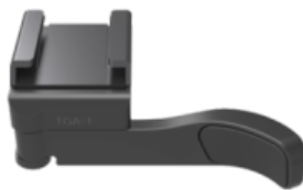
TGA-1 Thumb Grip with ergonomic design