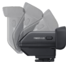
FDA-EV1MK Electronic Viewfinder Kit 2,359k dots XGA OLED Tru-Finder