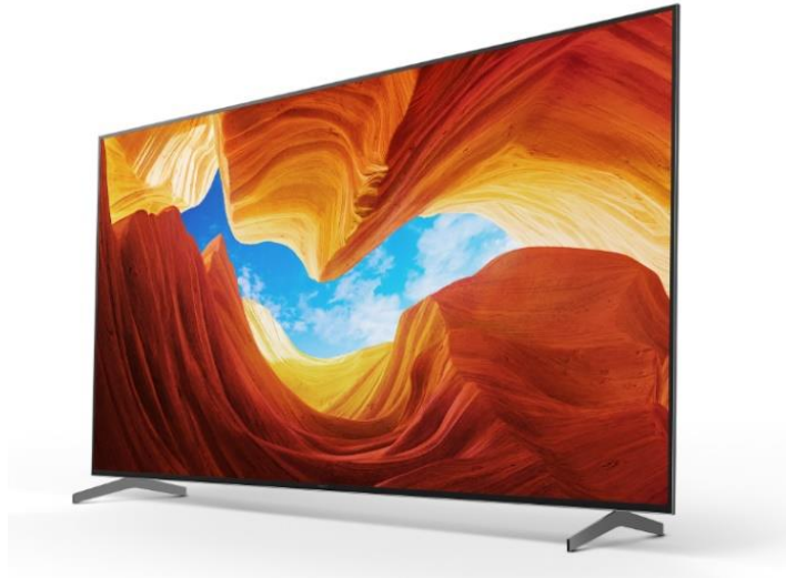
BRAVIA X9000H Series

Customers can subscribe to Apple TV+ on the Apple TV app on Sony's smart TVs, iPhone, iPad, Apple TV, iPod touch, Mac and other platforms, including at https://tv.apple.com/hk , for HK$38 per month. For a limited time, customers who purchase a new iPhone, iPad, Apple TV, iPod touch or Mac can enjoy one year of Apple TV+ for free ii .