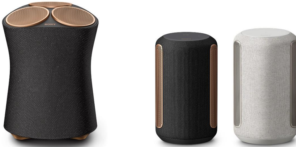
SRS-RA5000 and SRS-RA3000