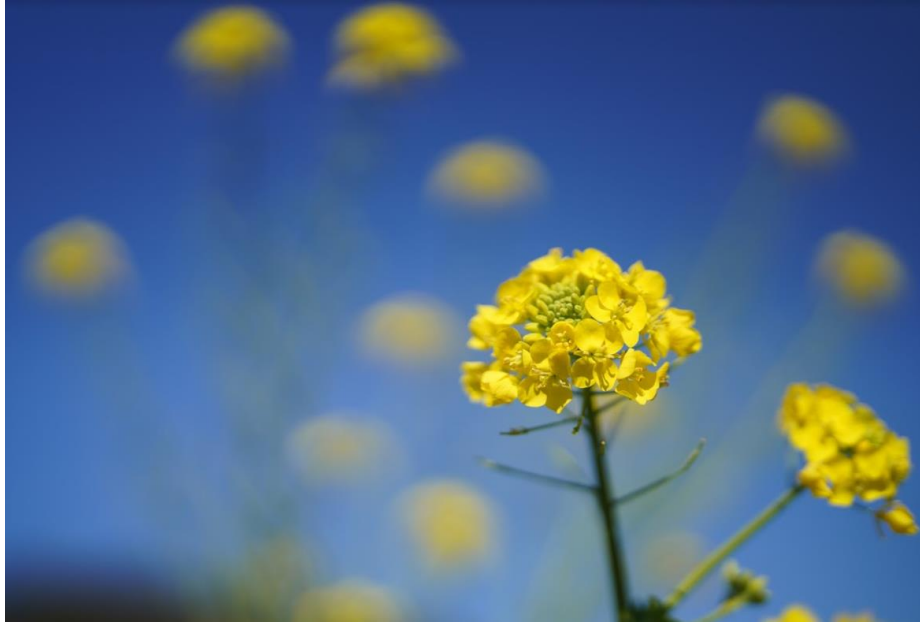
Shot with FE 50mm F1.2 GM and ILCE-7RM4