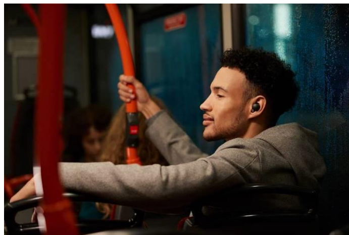
Adaptive Sound Control – Travelling

The headphones come with instant pause and play for a seamless experience. Just take the earbuds out of your ears and the music stops thanks to a proximity sensor that detects when you are wearing one or both earbuds. Simply pop them back in and the music starts again.