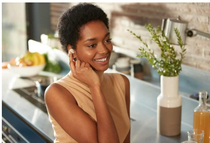
Intuitive touch control at your fingertips

The WF-1000XM4 feature intuitive touch control settings to have quick and easy control over your listening experience. Through the touch controls you can activate Noise Cancellation, Ambient Sound, Quick Attention mode or simply skip, pause or play songs.