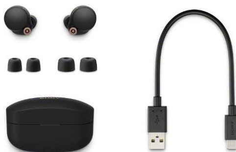
What’s in the box

Inside the box you’ll find 3 sizes of Noise Isolation Earbud Tips, as well as a USB-C charging cable.