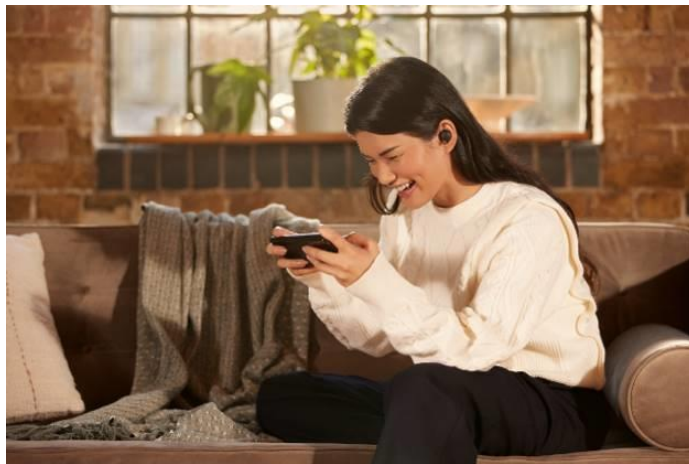
Stable Bluetooth® connection for video streaming and gaming

The optimisation of the transmission algorithm with the Integrated Processor V1 has made the connection more stable and less prone to sound skipping, even in an environment where there is interference, which means the WF-1000XM4 provide a clearer and more stable Bluetooth® connection.