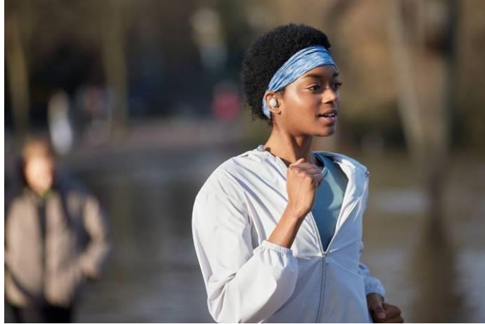
Automatic Wind Noise Reduction mode