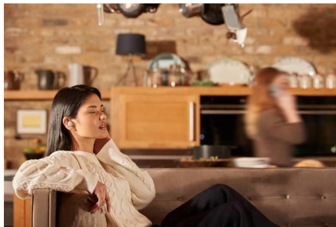
Industry-leading Noise Cancellation

A newly designed 6mm driver unit with a 20% increase in magnet volume also improves the WF-1000XM4's noise cancelling capabilities. The increase in magnet volume and the high compliance diaphragm gives improved performance in low frequencies and enhances noise cancelling by generating a high-precision cancellation signal to the low frequency range.