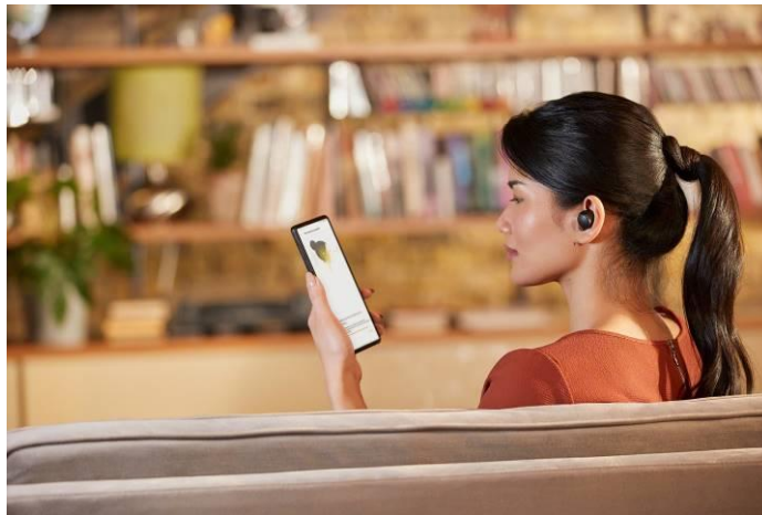
Sony | Headphones Connect App

You can now find the right fit for your ears with the Sony | Headphones Connect App. The app takes you through a few simple measurements to find the ideal size of Noise Isolation earbud tips vii to ensure maximum sound quality and minimum outside noise. Now you can enjoy maximum comfort with great sound.