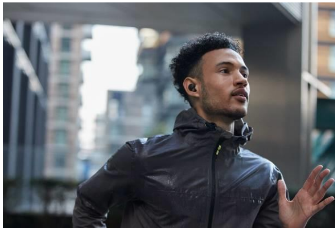
IPX4 water resistant for everyday use

With an IPX4 water resistance rating x , splashes and sweat won't stop the WF-1000XM4 – so you can keep on moving to the music. Whether you're running for the bus in the rain, or sat in a cosy office, these headphones will have your back.