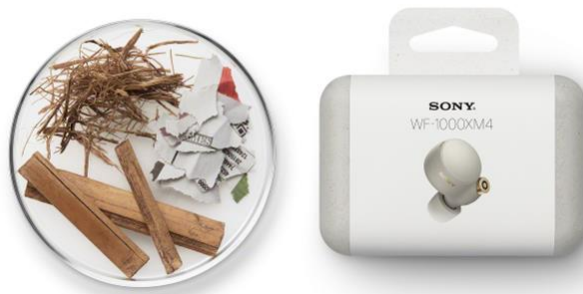
WF-1000XM4 plastic-free packaging