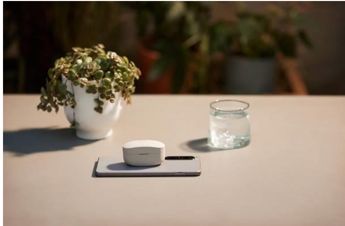
Wireless charging with Qi technology

No cables are necessary with the WF-1000XM4 thanks to easy wireless charging with Qi technology viii . You can even use a smartphone with Qi technology, like the latest Xperia model with the battery share function ix , to charge your headphones and charging case.