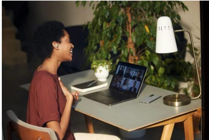
Precise Voice Pickup Technology