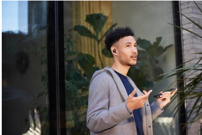
Hands-free help with “Hey Google”

The WF-1000XM4 headphones support Google’s helpful new Fast Pair feature. In one tap, the WF-1000XM4 enable quick, effortless Bluetooth pairing with your Android devices. Google’s Fast Pair feature lets you easily locate your headphones and also let you know when you’ve left the battery on and how much charge is left. The headphones also come with Microsoft Swift Pair, which makes it easy to connect with Windows 10 devices.