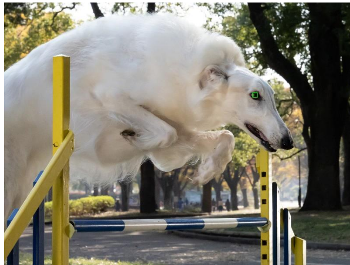
Shot with 105mm

Furthermore, both models offer continuous AF that performs AF / AE calculations at 60 times per second – enabling users to shoot and store 20 shots (20fps) with high precision, accurate focus and optimised exposure viii . This level of performance is comparable to that used in professional sports cameras such as the Alpha 9 series. The BIONZ X™ processor enables users to shoot in low-light scenarios in Burst Mode for the first time, producing results with noise reduction that have never previously been possible in predecessor models.