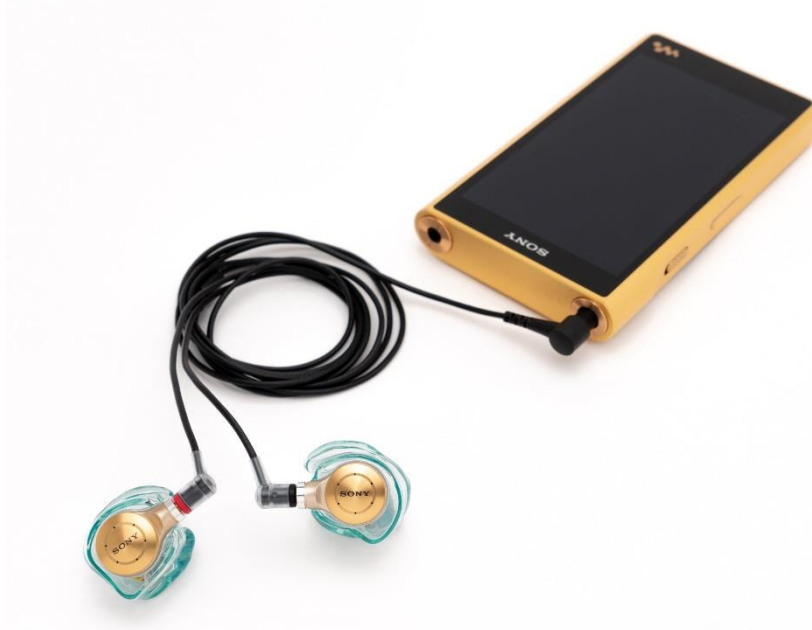
Just ear XJE-MHRWM1M2 with NW-WM1ZM2

Sony also launched the Just ear XJE-MHRWM1M2 which is tuned by engineers during long term field tests and provides the best sound tuning for NW-WM1ZM2 , bringing a superior sound experience to music lovers.