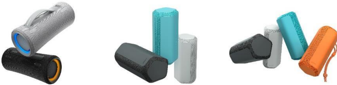
SRS-XG300, SRS-XE300 and SRS-XE200

Sony expands its wireless speaker X-Series range with 3 new models that let you LIVE LIFE LOUD