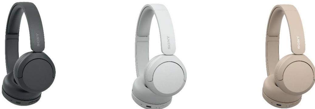
WH-CH520 in Black, White and Beige