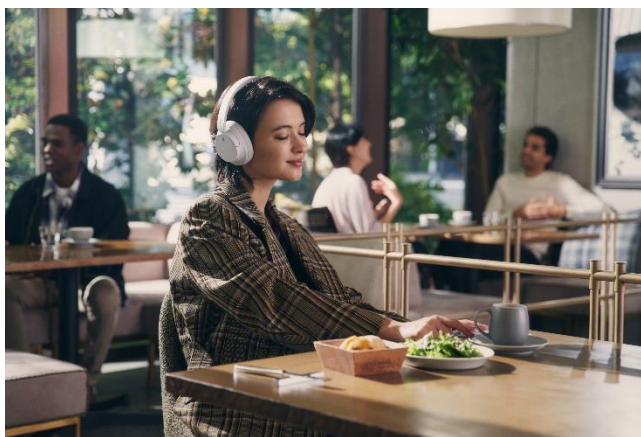
Noise cancelling on the WH-CH720N White

Whether you're flying long-haul or relaxing in a café, the over-ear WH-CH720N headphones deliver Sony's advanced noise cancelling performance thanks to the Integrated Processor V1 chip and Dual Noise Sensor technology, so you can enjoy more music and less background noise.