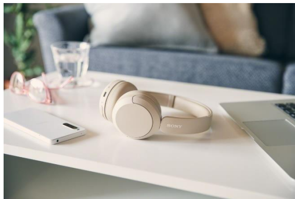
Great call quality on the WH-CH520 Beige

Improved technology features on the WH-CH720N mean you can enjoy even better call quality. Beamforming microphones with Precise Voice Pickup technology are smartly positioned to pick up your voice more clearly and accurately in a range of environments. A newly developed Wind Noise Reduction Structure around the microphones reduce background noise for you, keeping conversations and music clear and uninterrupted.