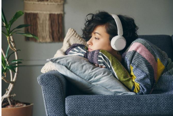
Superb sound on the WH-CH520 White

Whether you're listening to electrifying pop or bassy rap, the WH-CH720N and WH-CH520 allow you to tailor your sound using the Equaliser in the Sony | Headphones Connect app. You can choose from a variety of settings to match sound quality with the music genre you're listening to or even create and save your own settings.