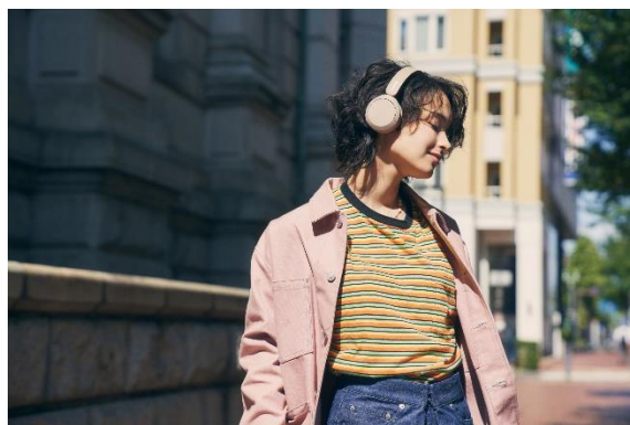
Lightweight design with the WH-CH520 Beige

You'll never need to take a break from your favourite music with the WH-CH720N. The over-ear headphones are ergonomically designed to be comfortable for even longer periods. At just 192g, the WH-CH720N are Sony's lightest overhead wireless headphones with noise cancelling. Comfortable synthetic leather and urethane materials combine with optimum ear pad structure and dimensions for exceptional wearability. With up to 35 hours battery life with noise cancelling on, you'll have enough power to keep listening all day and into the night.