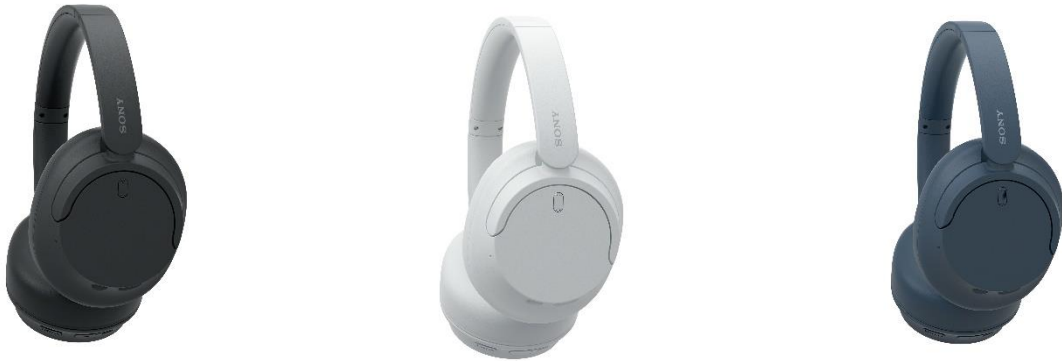
WH-CH720N in Black, White and Blue