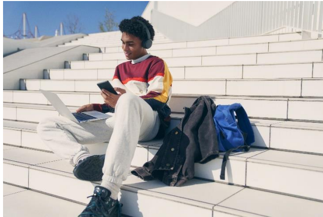
Multipoint connection on the WH-CH520 Black

Both the WH-CH720N and WH-CH520 feature Multipoint connection, easy button operation and can be controlled with your voice ii . Since the connection is easy with Swift Pair and Fast pair, these headphones are ideal for everyday use.