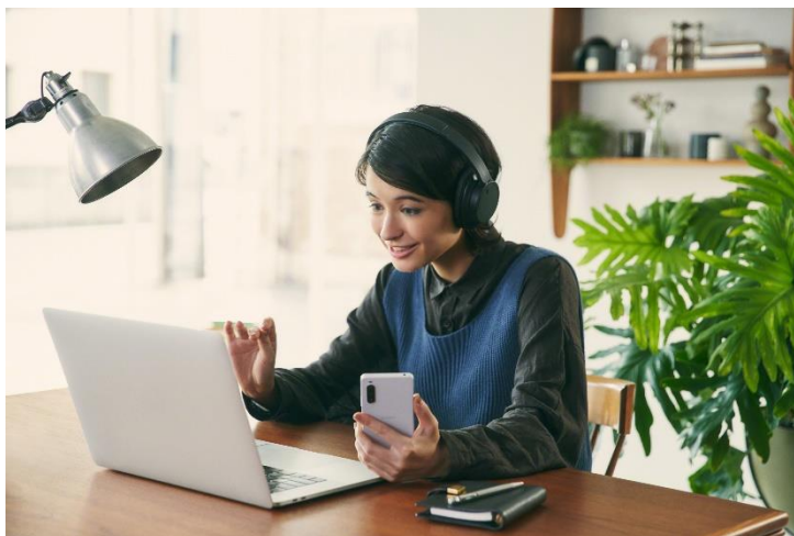
Multipoint connection on the WH-CH720N Black

Both models also feature Digital Sound Enhancement Engine (DSEE) to produce high-quality sound exactly as the artist intended as well as Multipoint connection for easy connectivity between devices.