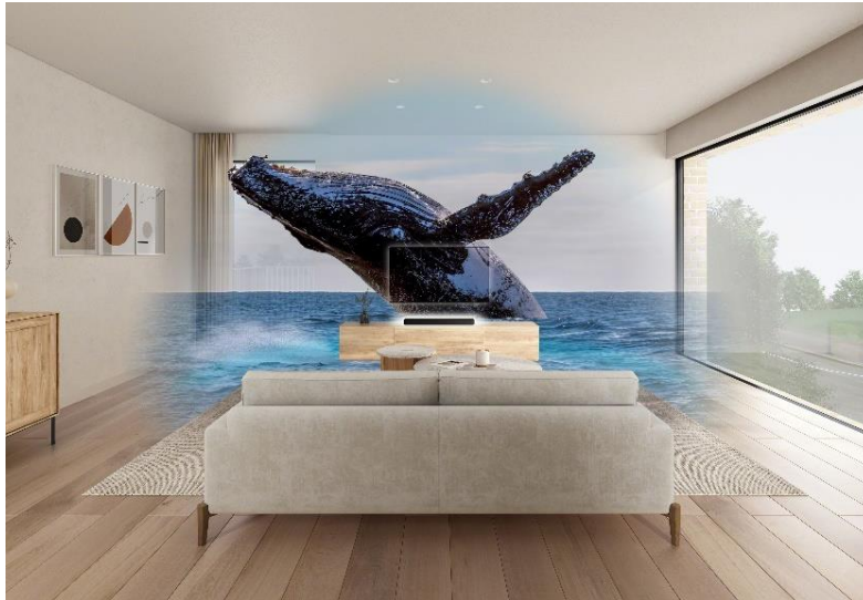
Three-dimensional surround sound

With Sony's newly developed up mixer, users can experience three-dimensional surround sound not only with surround sound format content, but also with stereo content, like streaming video or music services. Analysing the track in real time, Sony's new algorithm extracts individual sound objects depending on their localisation and reallocates them, resulting in three-dimensional surround sound.