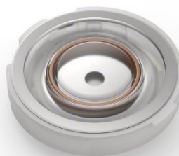
Dynamic Driver X

By combining Sony's newly developed HD Noise Cancelling Processor QN2e and Integrated Processor V2, the WF-1000XM5 incorporates precision 24-bit audio processing and high-performance analogue amplification. The result is low distortion and crystal-clear audio reproduction.