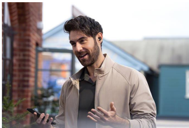
Best ever call quality

The WF-1000XM5 now feature Sony's best ever call quality 2 , delivering your voice clearly in every situation whether you're in the office, working from home, in a public space or a noise place.