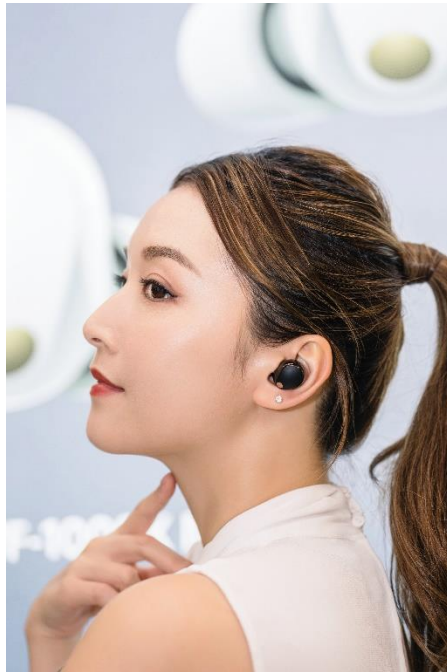
Designed with comfort in mind

1000XM4), making them more comfortable to wear for extended periods.