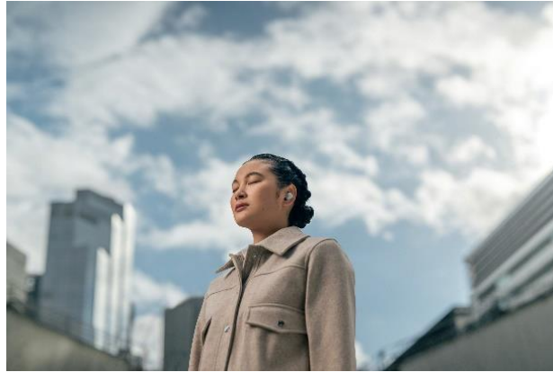
Immersive audio experience

Premium sound quality continues to be at the heart of the WF-1000XM5's design with support for High-Resolution Audio Wireless thanks to LDAC, as well as DSEE Extreme™ to upscale compared digital music in real time. Additionally, the earbuds feature 360 Reality Audio, which creates an immersive audio experience that transports you into the centre of the music 3 .