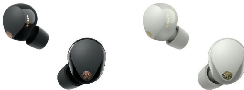
WF-1000XM5 in Black and Platinum Silver