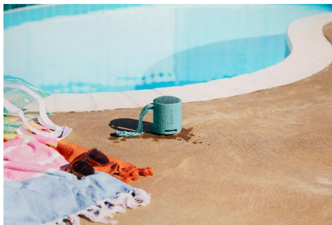
IP67 Rating, Waterproof and Dustproof

The SRS-XB100 speaker is everything you need for life on the move. The speaker includes a passive radiator for powerful sound and offers clear sound even at high volumes thanks to the off-centre diaphragm. Don't be fooled by its compact shape, this little speaker packs an impressive wide spreading sound. The Sound Diffusion Processor expands sound in any space, with its DSP technology.