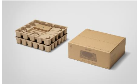
Recycled packaging reflects Sony's ongoing commitment to sustainability

PS-LX5BT offers one-button full auto playback and Bluetooth® connectivity 1 supporting aptX™, aptX™-Adaptive, and Hi-Res Wireless Audio 2 allowing users to enjoy detailed sound even wirelessly, as well as through a wired connection. A high-quality cartridge, aluminum platter, and transparent dust cover provide stable playback and protection. PS-LX5BT supports 33⅓ and 45 RPM records (7" and 12") and arrives in recycled packaging, reflecting Sony's ongoing commitment to sustainability.