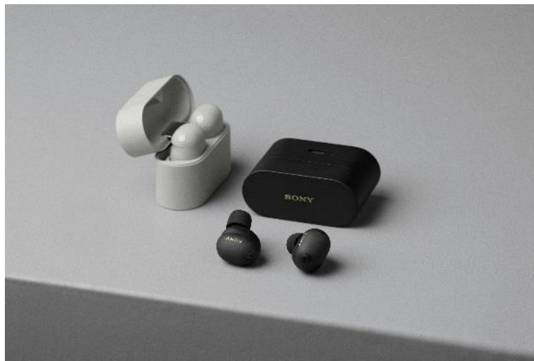
The WF-1000XM6 in Platinum Silver and Black

HONG KONG, 13 February 2026 - Sony is today introducing the next generation of its critically acclaimed 1000X series with the WF-1000XM6 truly wireless noise cancelling earbuds.