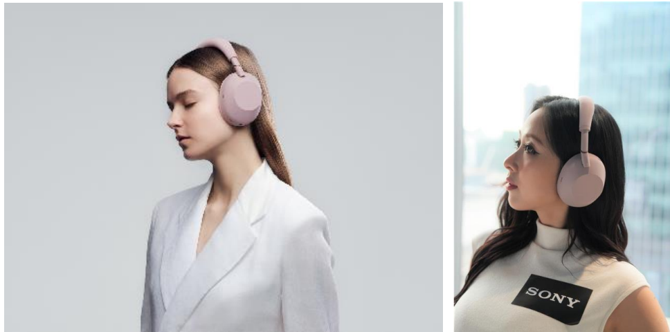
WH-1000XM6 in Sand Pink

In addition, Sony is also introducing a Sand Pink version of its much-loved WH-1000XM6 overhead wireless noise cancelling headphones.